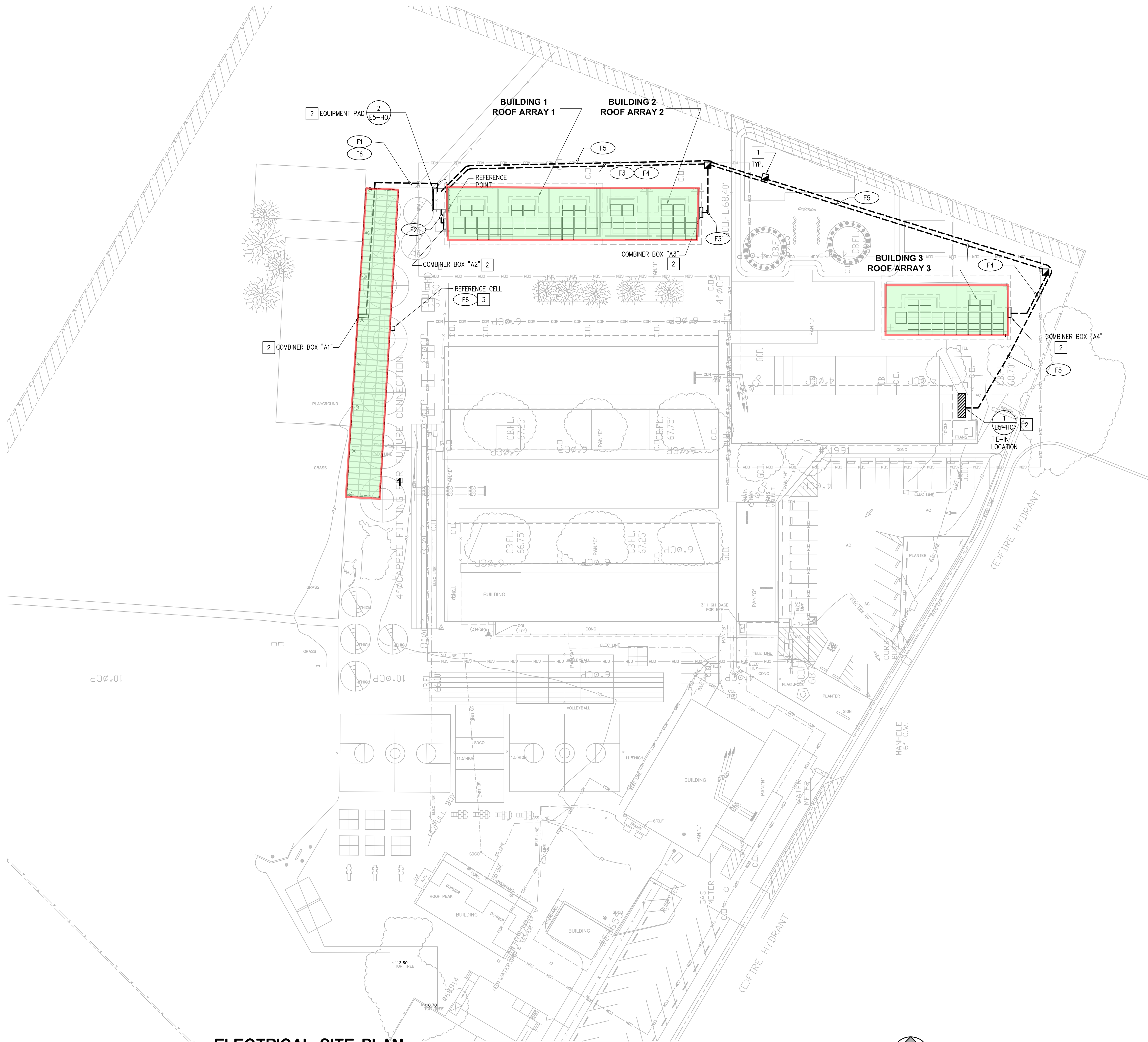
1 ELECTRICAL SITE PLAN