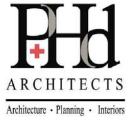
EXHIBIT G CONTRACTOR PROPOSAL & RATE SCHEDULE (Classroom Renovation for IHA at Mt. Diablo High School)

The amount of compensation shall be based upon the following percentage for each Phase contemplated under this Proposal: