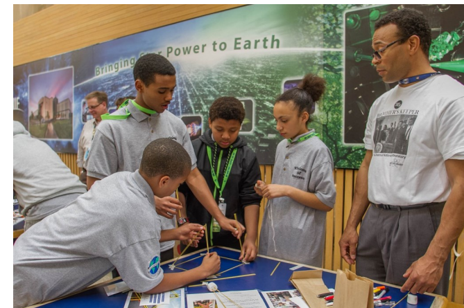
Lawrence Livermore Lab