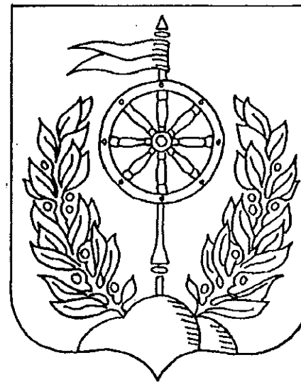
SISTER CITY SINCE 1991

There has been a settlement at this site since the time of the Roman Empire. Throughout its long history, Siófok has preserved its rightful place as the capital of the "Hungarian Sea".