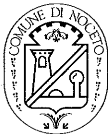
SISTER CITY SINCE 1987

The first historical reference to Noceto was in 835 A.D., even though its origins date as early as 183 B.C. Noceto officially became a city in 1795, in the republic of Cisalpina, and again in 1860, the year Italy was unified.