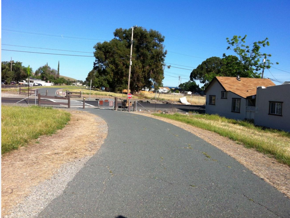
Delta de Anza Trail