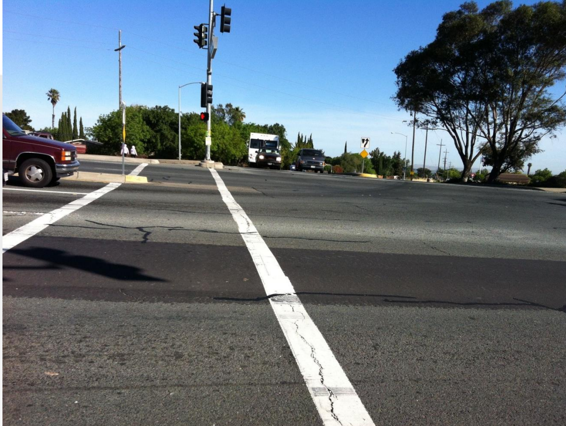
Intersection of Willow Pass Road and Port Chicago Hwy. (3 blocks from Enes & Water St.)