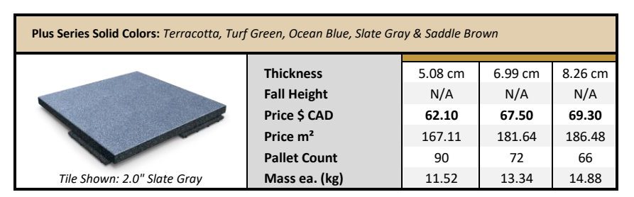
*All Tiles are 610 mm x 610 mm