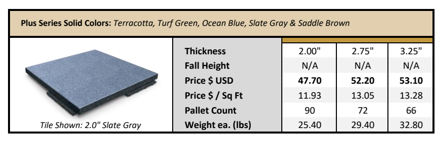
*All Tiles are 24 in x 24 in