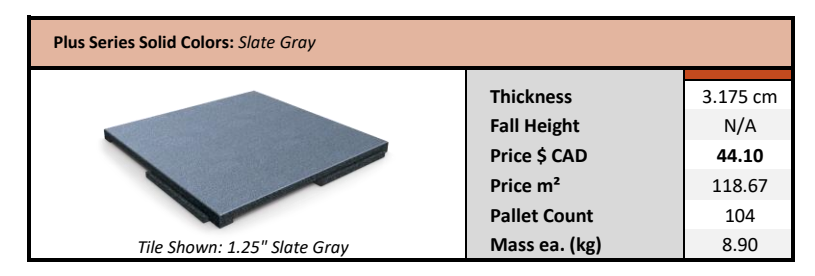
*All Tiles are 610 mm x 610 mm