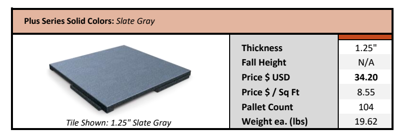
*All Tiles are 24 in x 24 in